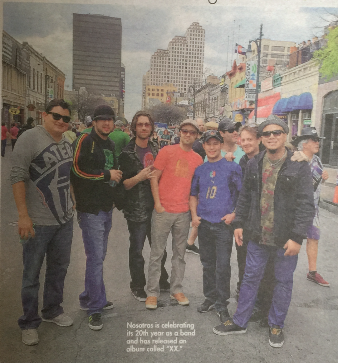
Nosotros is celebrating its 20th year as a band and has released an album called "XX."